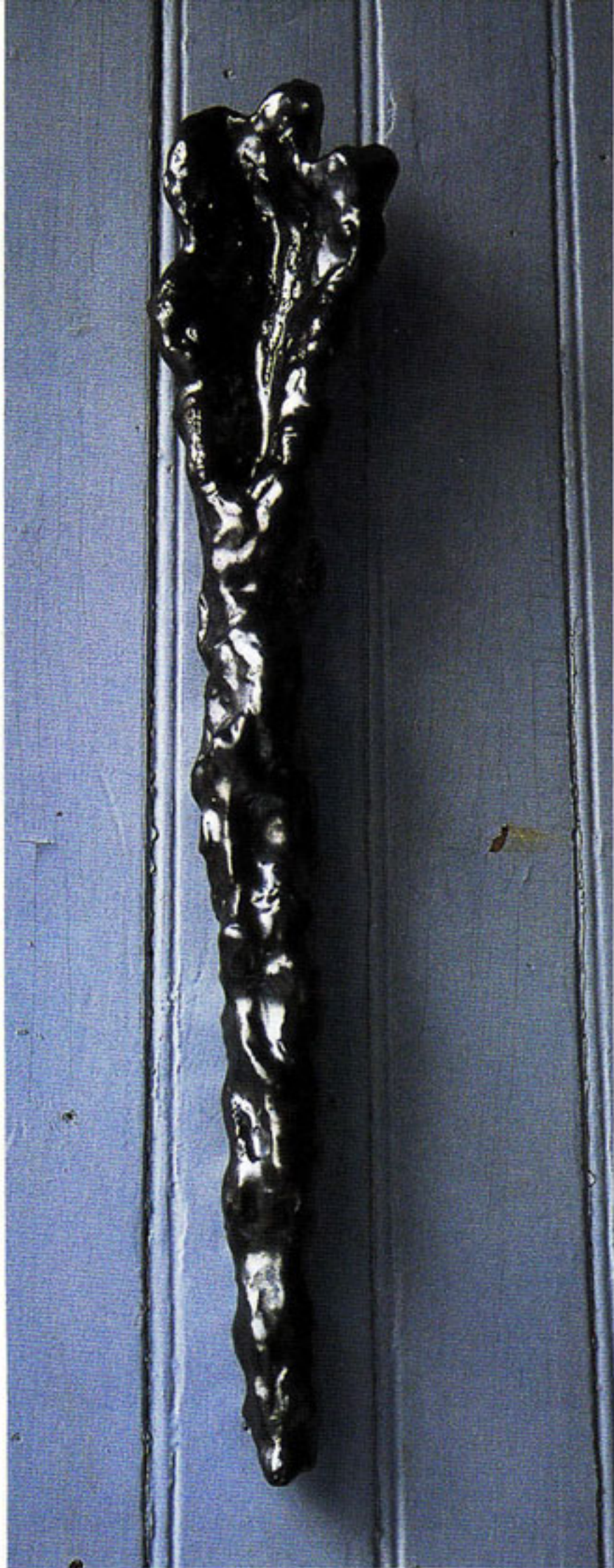
Hanging Object. White stoneware. 40 cm/h.