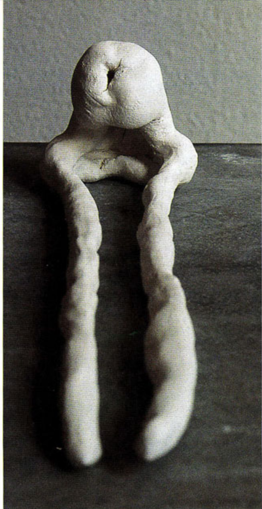
Suspended Object. White stoneware. 40 cm/h.