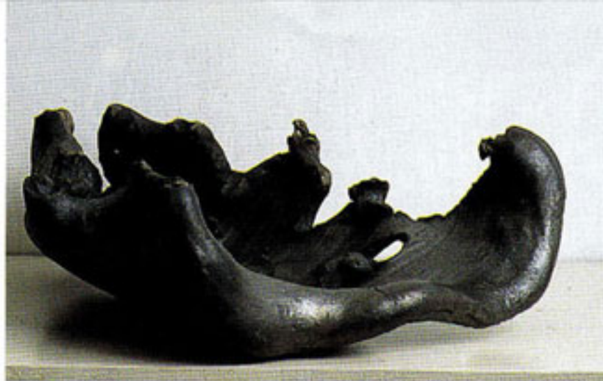
Black Raku. 40 x 60 cm.

Another group of sculptures seem to have emerged from watery-pink jellyfish but are solid, opaque forms with trailing, stiff white tentacles the colour of medicinal tablets. However, these are far removed from the mass production lines of factory perfection. Instead they celebrate exquisite imperfection; alerting us to what is tender and humane. One of the most touching pieces was a hanging ceramic, reminiscent