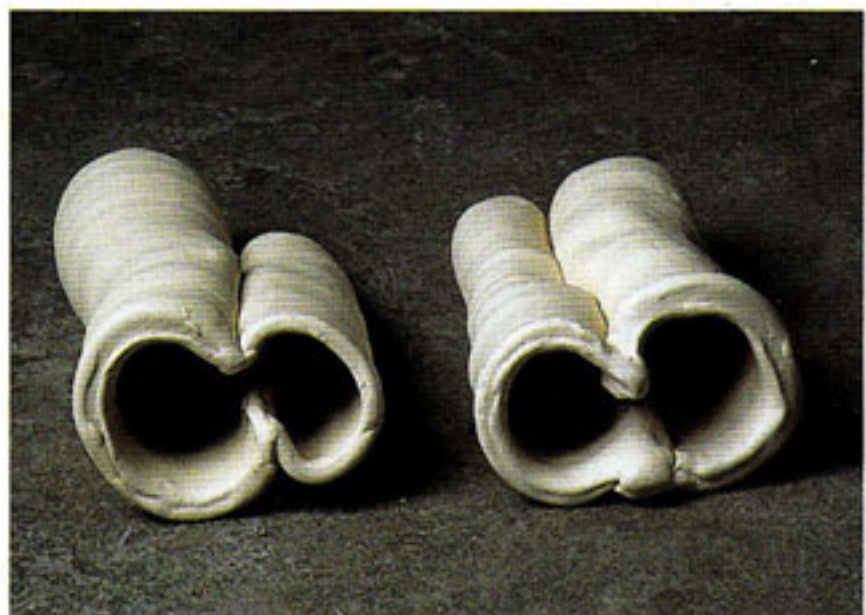
White stoneware, terra sigillata. 25 x 15 x 45 cm.