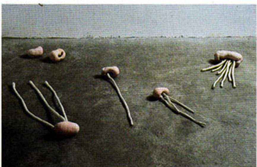
White stoneware. 40 cm/h.

of a gently protruding cervix with two drooping tubes, carefully suspended on the wall but just longing to be held, like a young girl's pigtails waiting to be played with and fondled. In fact, Bosland's work invites touch and a desire to nurture that cannot be reciprocated, so her pieces remain tantalising to viewers in the way they offer but cannot provide comfort due to the fact that they are hard, unyielding objects. Because they bear traces of the unconfined pleasure in making, they seem remarkably non-contrived. It is as if freedom has been solidified in these innocent lumps. Such immediacy is difficult to produce and rarely found in contemporary sculpture but these pieces have the unexpectedness of growths of fungi on damp logs, whilst also being sophisticated utterances in clay.